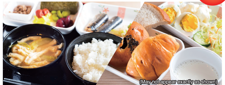
(May not appear exactly as shown)

Super Hotel salads are safe and healthy.