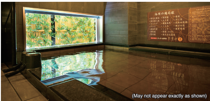
(May not appear exactly as shown)

* With heating and circulation filtration.