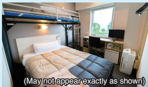
(May not appear exactly as shown)