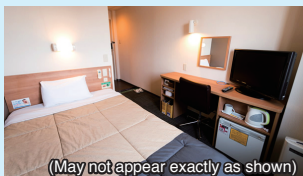
(May not appear exactly as shown)