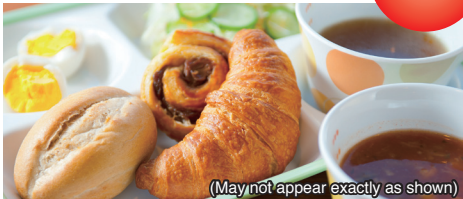
(May not appear exactly as shown)

Super Hotel salads are safe and healthy.