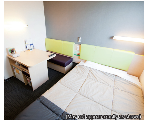
(May not appear exactly as shown)

Extra single room (up to 2 guests) 12 m 2