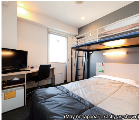
(May not appear exactly as shown)