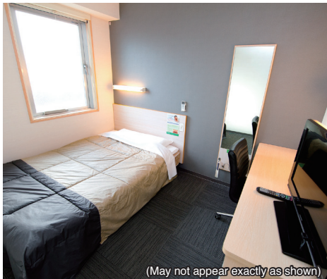
(May not appear exactly as shown)