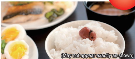
(May not appear exactly as shown)

Super Hotel salads are safe and healthy.