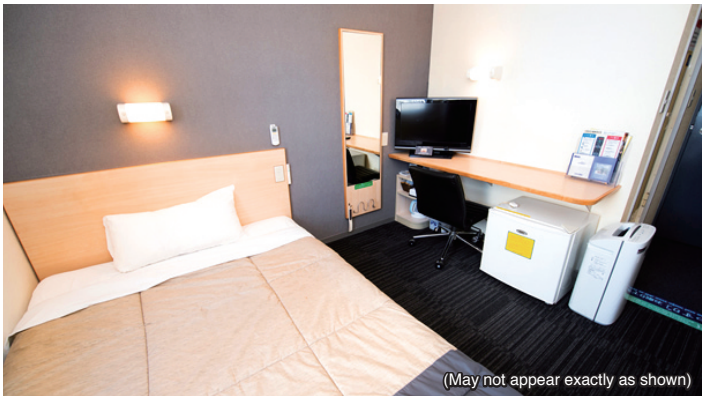
(May not appear exactly as shown)