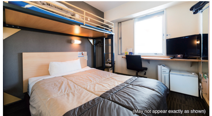
(May not appear exactly as shown)